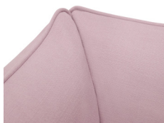
Washable and replaceable covers