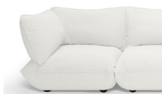
Easily to assemble