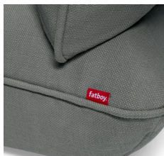
FibreGuard stain resistant technology