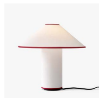
→ White & Merlot