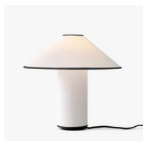
→ White & Black