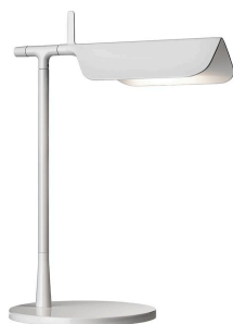
Table lamp. Body in painted pressofused aluminium. Multi-led diffuser in specially designed PMMA to avoid the Multi Shadow effect and dazzle. Head rotation \pm 45^\circ .