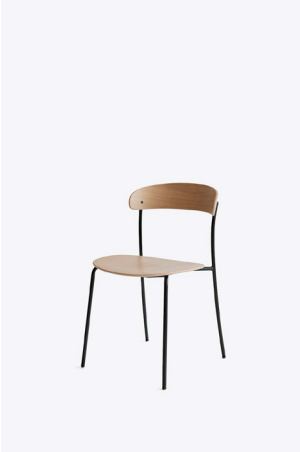
Laquered Oak w. Black Frame