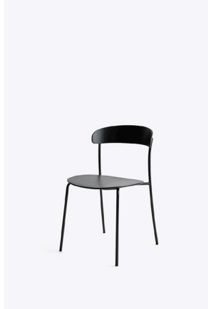
Black Lauquered Oak w. Black Frame