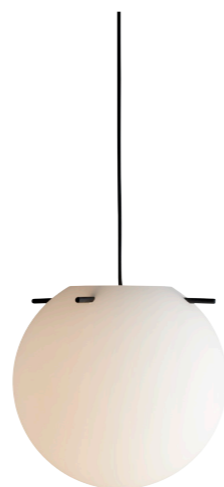
Item Number: 135351

Koi is an exquisite design lamp that seamlessly blends the elegance of Japanese traditional hairstyles with the simplicity and functionality of Scandinavian minimalism. Drawing inspiration from the rich cultural heritage of both Japan and Scandinavia, Koi creates a unique and captivating lighting experience.