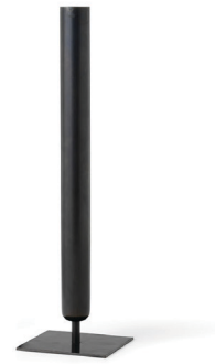
Bronzed Brass 4784859