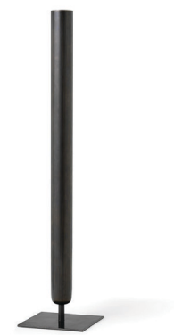
Bronzed Brass 4785859