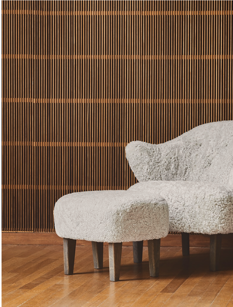
INGEBORG, OTTOMAN Designed by Audo